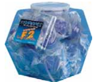
Part No. 8125