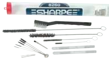
Part No. 8260