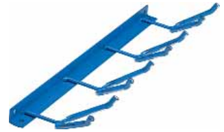
Part No. 9894