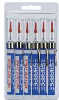
Part No. 8255