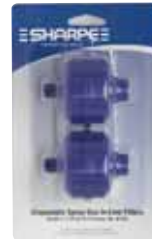
Part No. 8100