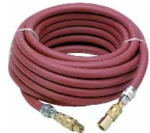
Part No. 7230