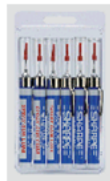
Gun Lube Part No. 8255